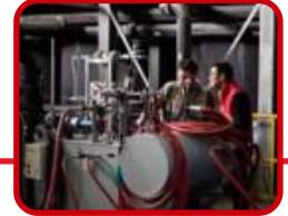
Industrial maintenance & repair