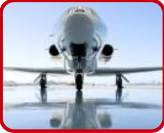
Aircraft manufacturing & maintenance