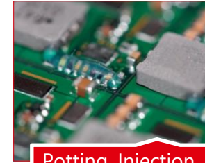
Potting, Injection, Encapsulation