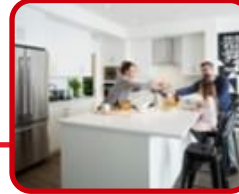
Furniture and building components