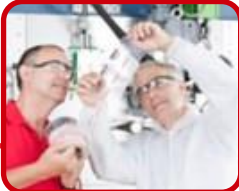
Tapes, labels and graphics