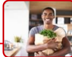
Packaging and Paper