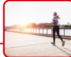
Sports and fashion